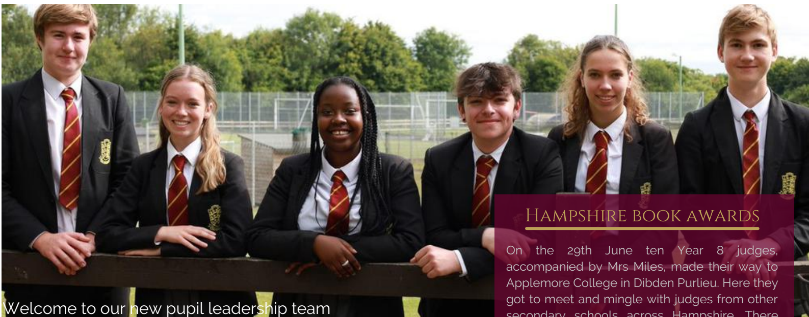
Welcome to our new pupil leadership team