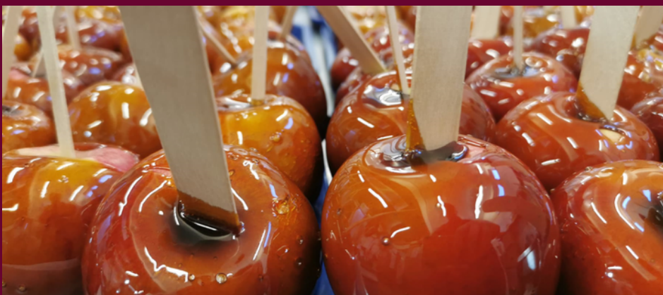
Homemade Toffee Apples