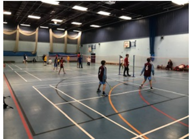
ST FRANCIS - YR 5/6 BADMINTON WINNERS