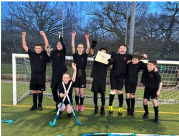
CHERBOURG - YR 5/6 HOCKEY WINNERS

We have held 5 events for our Primary Schools so far this term including Yr 5/6 Badminton for our Eastleigh cohort at Thornden, Yr 5/6 Girls Football at Toyndee and 2 Yr 5/6 Hockey events, one at Kings' and one at Thornden. These are all qualifiers for the County level competitions and have allowed over 300 pupils from 19 different schools and of all abilities, to participate. We have used Young Leaders from Kings' (along with others from Thornden and Toyndee) at several of these events to officiate and help, which they have done with great spirit and competence. It has been great to see their enthusiasm and willingness to help the younger pupils participate.