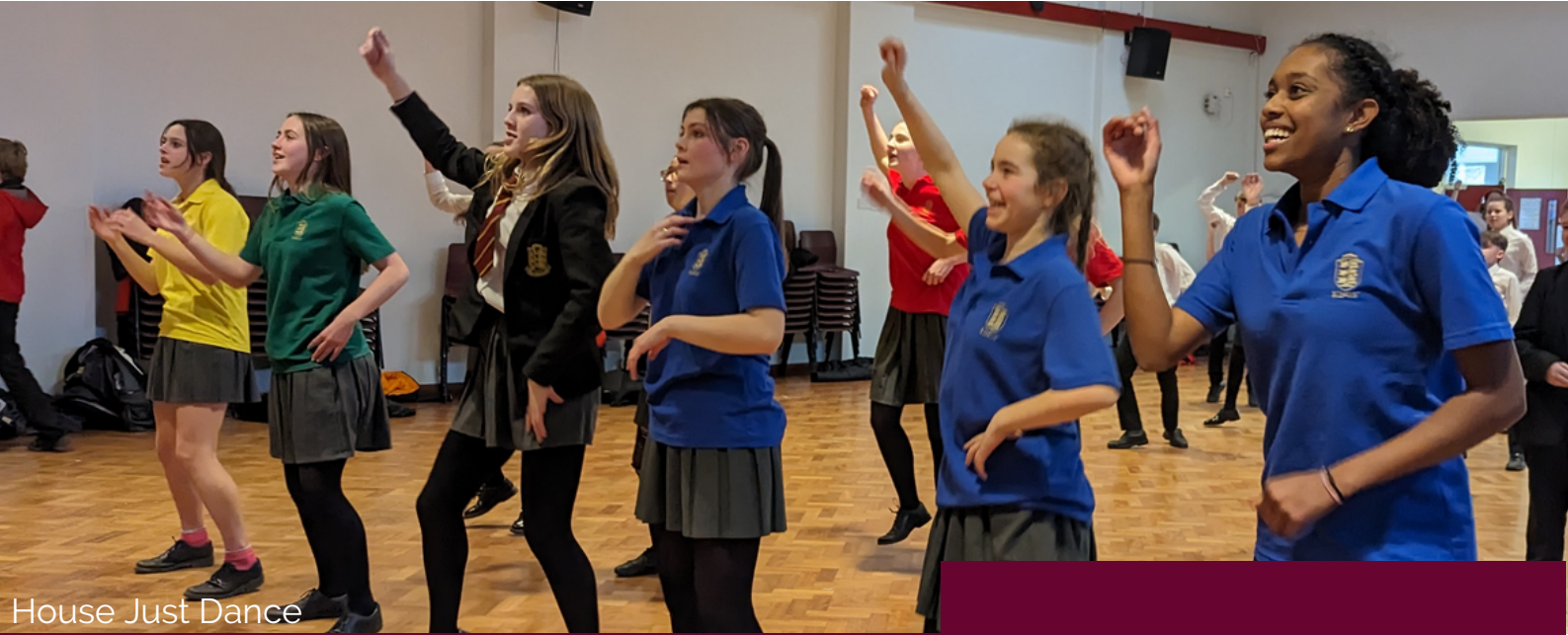
House Just Dance