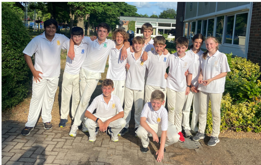
U13 MIXED TEAM AFTER WINNING THEIR HAMPSHIRE STATE SCHOOLS CUP SEMI FINAL.