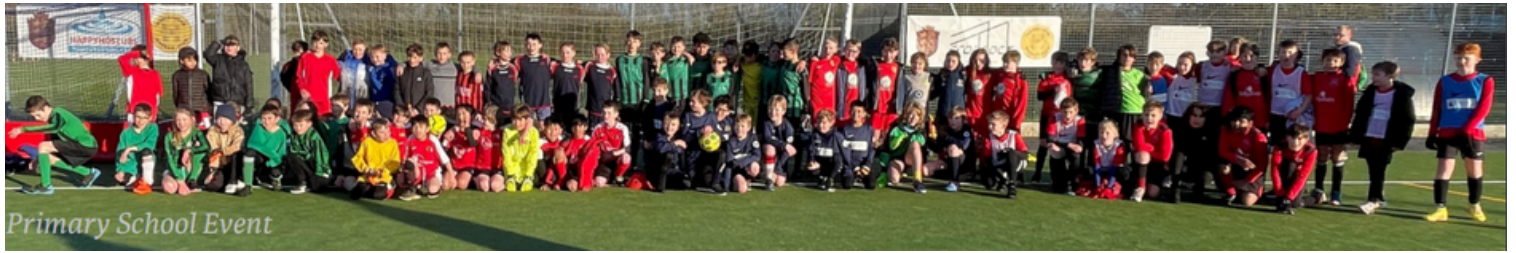
Primary School Event

On Weds 18th January, 17 Year 5&6 boys' football teams travelled to Kings' for an afternoon of competitive football. Teams were split into two pools with 6 games played constantly across the two hours. At the end of the pool games, there was a semi-final involving Oliver's Battery, Weeke, Kings Worthy and Westgate. Kings Worthy and Westgate won their tightly fought games to make it through to a very passionate final! Following a lot of extra time and a very evenly matched final, Westgate reigned supreme (despite being beaten by Kings Worthy in their earlier pool). Lots of fun was had by all, alongside a lot of exposure to a hugely popular sport. A big thanks to all the staff, both at Kings;' and from the primary schools who go out of their way to make these things happen, as well as the support of many parents.