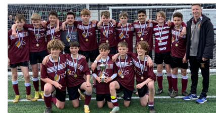
U13 BOYS' FOOTBALL