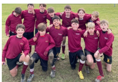
U12 BOYS' RUGBY