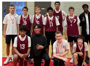
U14 BOYS' BASKETBALL