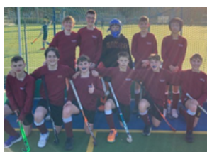
U13 BOYS' HOCKEY