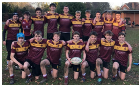
U15 BOYS' RUGBY