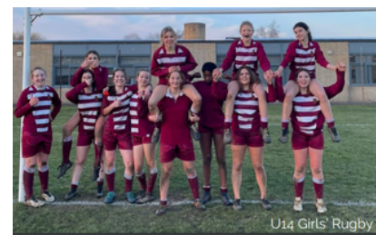
U14 GIRLS' RUGBY