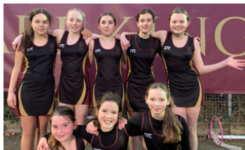
U12 GIRLS' NETBALL