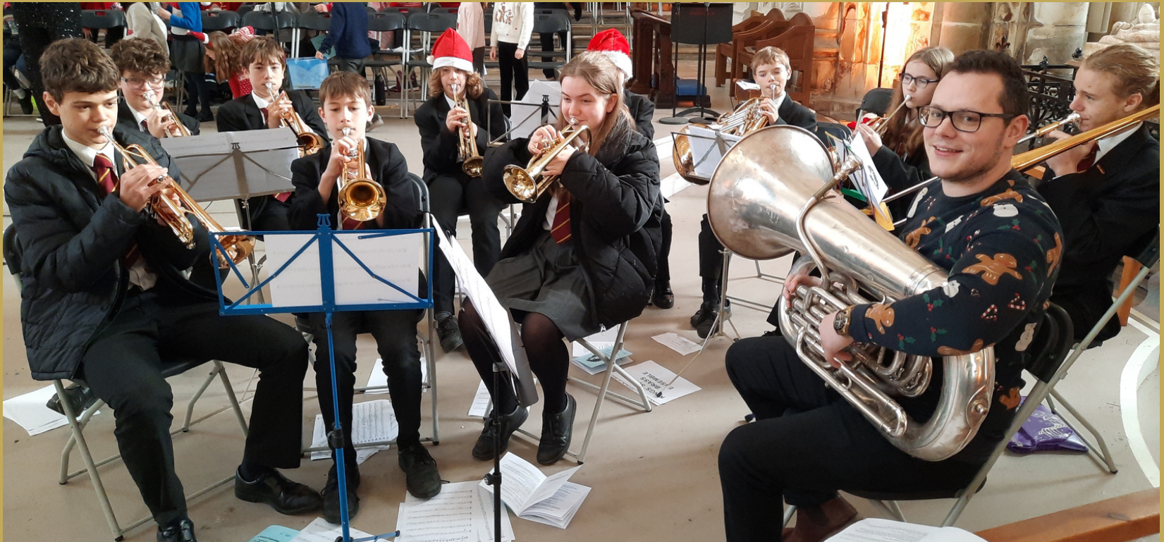
Pupils from Kings' School participated in the Hampshire Music Service's Celebratory event at Winchester Cathedral.