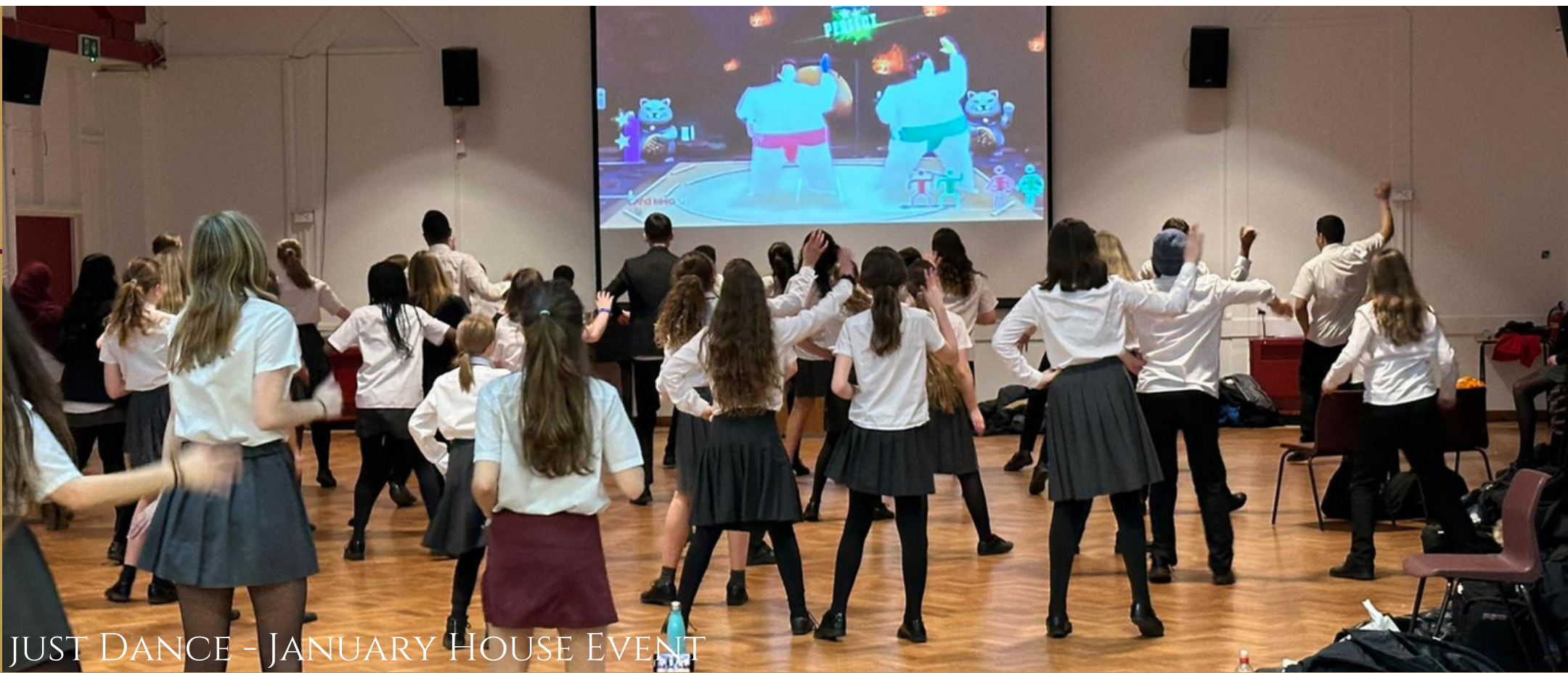
JUST DANCE - JANUARY HOUSE EVENT