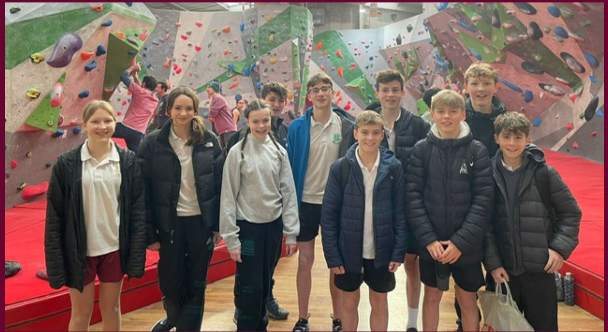
10 Pupils were carefully selected to represent Kings' School Winchester in an Inter Schools Competition at Boulder Brighton. Currently waiting on the results.