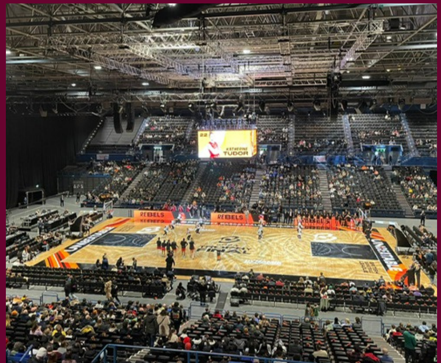
Sunday 28th January, 45 pupils and 5 staff travelled to Birmingham Utilita Arena for the British Basketball Womens & Mens Trophy Finals. A great day out was had by all.