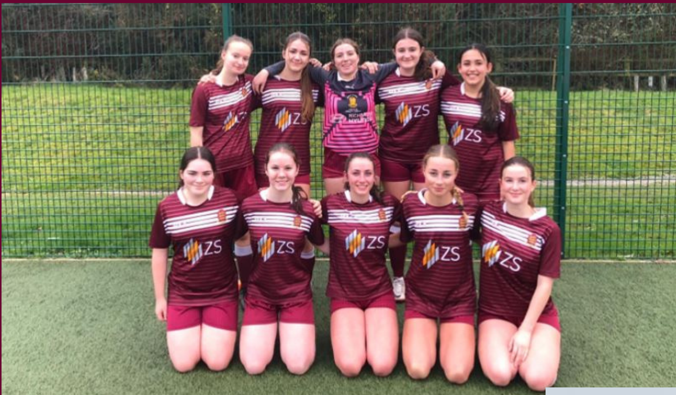
U16 Girls Football Kings' 3 - 0 Swanmore Into the District Cup Final!