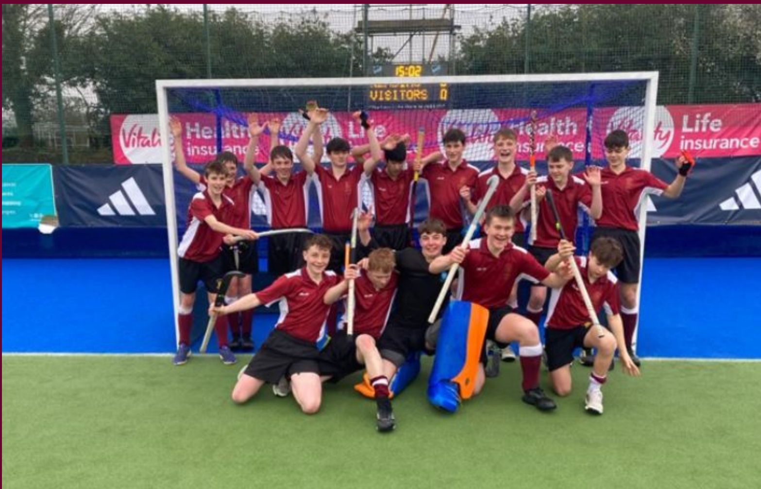
U16 BOYS HOCKEY

CONGRATULATIONS SOUTH CENTRAL ENGLAND CHAMPIONS!