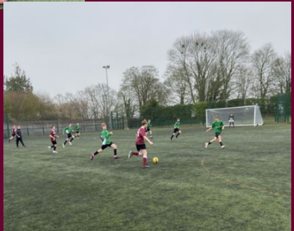
U14 Boys Football Kings' 4 - 0 Henry Beaufort A strong performance in the District league.