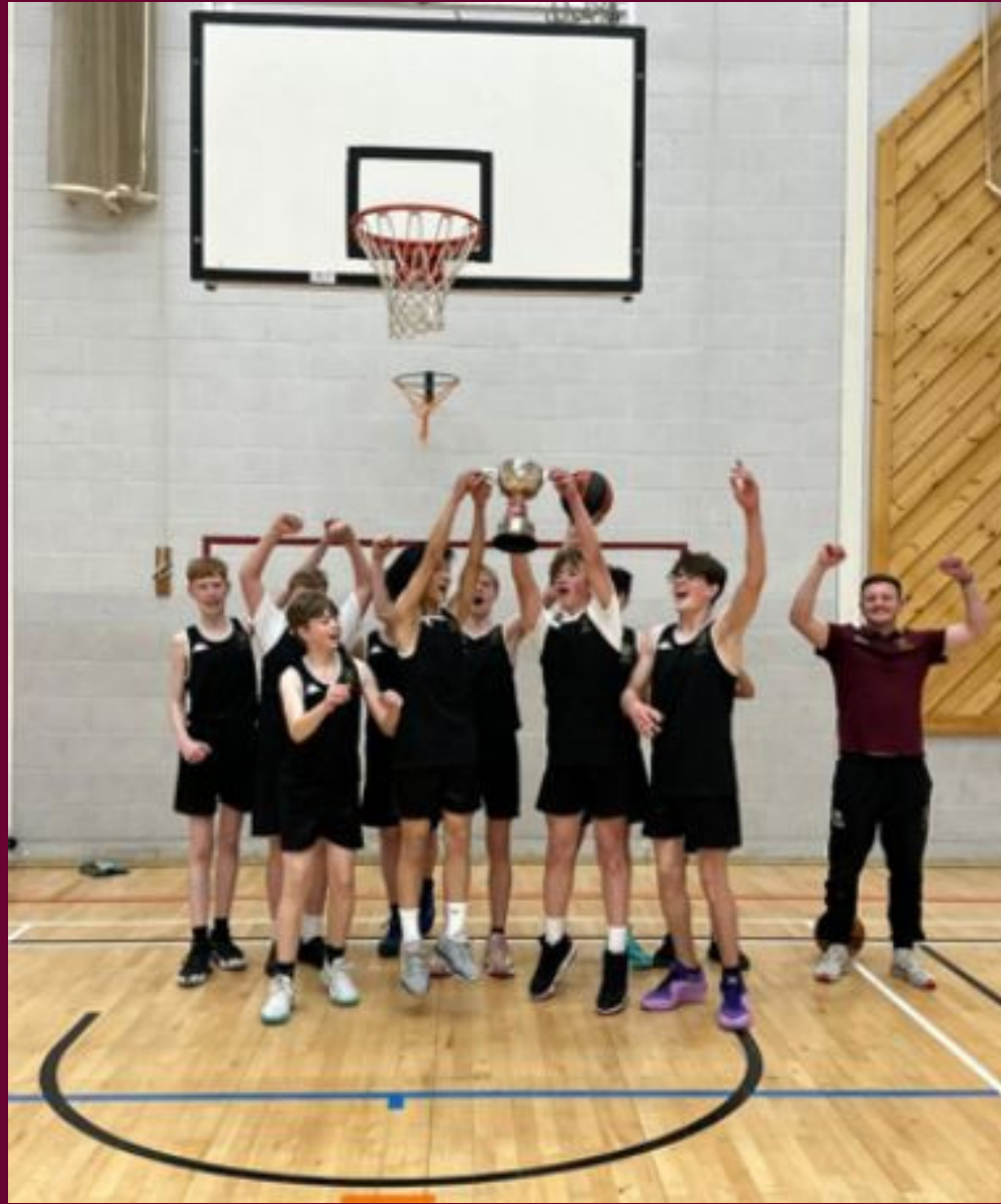
U14 BOYS BASKETBALL