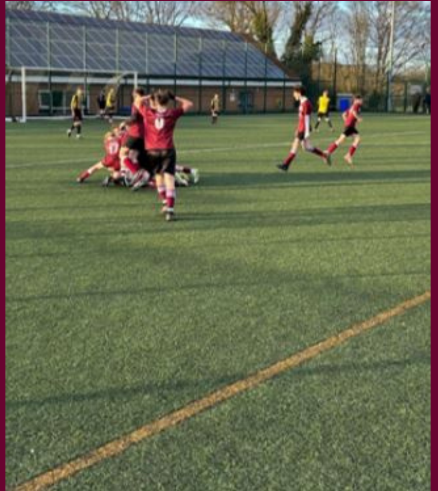
U13 Boys Football Kings' 6 - Shenfield 3 Three goals in extra time take us into the National Semi-final